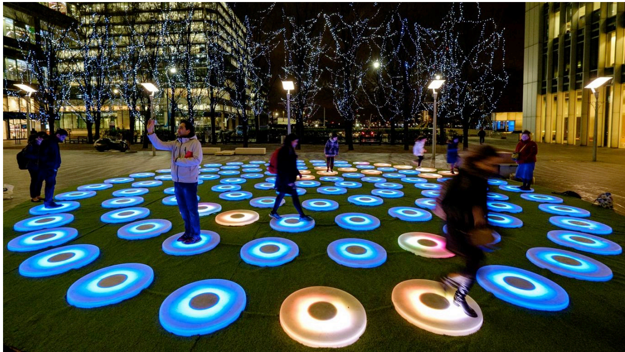
The Pool Jen Lewin Studio